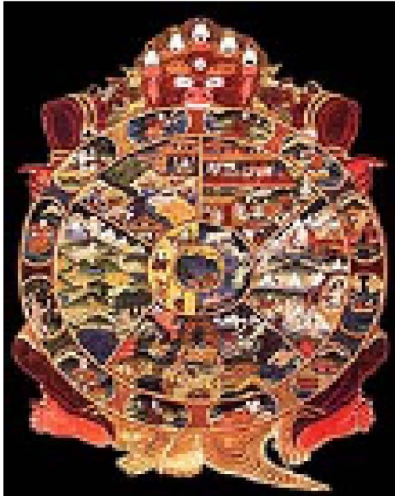
Figure 1; The wheel of life

The wheel of life (see for instance www.buddhanet.net/wheel1.htm for a guided tour and www.digitaldharma.org/g15.asp for an extended explanation) depicts a wrathful figure grasping a large plate-like image. Around the edge of this are images depicting the "links of independent origination" - from one o'clock onwards: